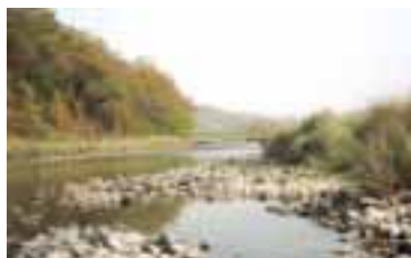
Stream inside the Corbett National Park

Jim Corbett National Park is a getaway that provides ample recreation facilities and you can escape from the busy city life to find solitude. The best months to visit Jim Corbett National Park are April to June and November to March (ideally for bird watching).