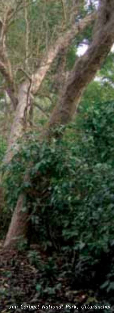
Jim Corbett National Park, Uttaranchal