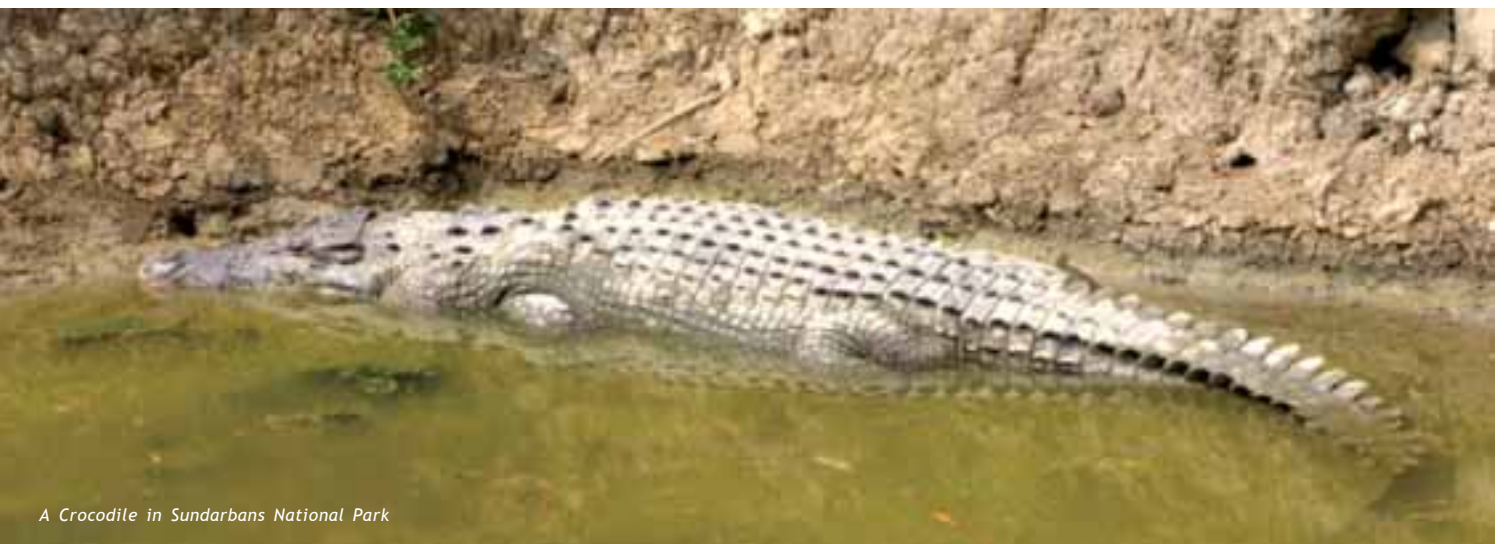
A Crocodile in Sunderbans National Park

Bird watchers can spot seven colourful species of the Kingfisher, white bellied Sea Eagle, Plovers, Lap-Wings, Curfews, Sandpipers and Pelican. The best time to visit Sunderbans National Park is during the months of September and May. ■