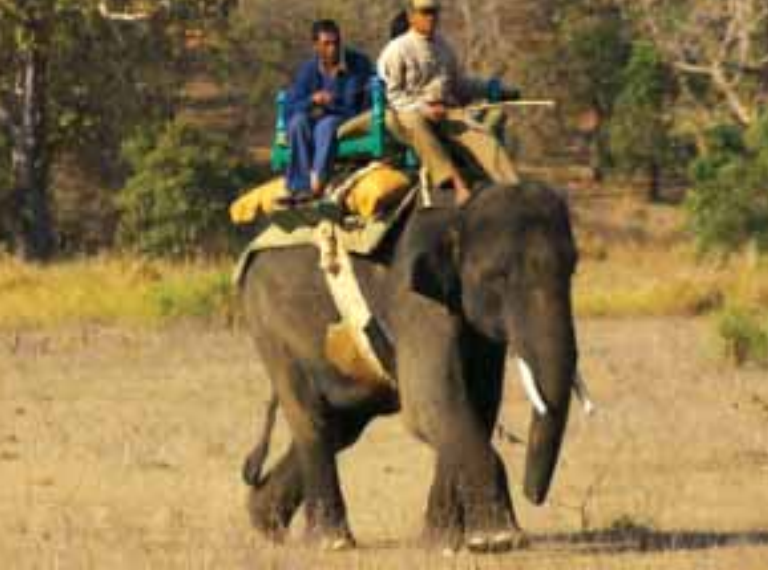
Elephant Safari in Kanha National Park