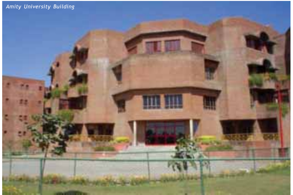
Amity University Building

AMITY UNIVERSITY GUARANTEES HOLISTIC DEVELOPMENT OF ITS STUDENTS TURNING THEM INTO NOT JUST SUCCESSFUL PROFESSIONALS BUT ALSO ETHICAL AND RESPONSIBLE HUMAN BEINGS. WITH IT'S MOTTO WHERE "MODERNITY BLENDS WITH TRADITION", THIS IS INCIDENTALLY, THE COUNTRY'S FIRST LARGEST, MOST HI-TECH PRIVATE UNIVERSITY. WITH THE UNIQUE MENTOR-MENTEE CONCEPT THAT IT FOLLOWS, STUDENTS RECEIVE CONTINUOUS GUIDANCE FROM TEACHERS, PARENTS, ALUMNI AND THE INDUSTRY.