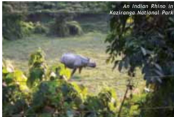
An Indian Rhino in Kaziranga National Park

Besides the great one horned Indian rhino one can also spot the Indian elephants, Indian bison, swamp deer, hog deer, tigers, sloth bears, leopards, otters, langurs, wild boar, jackal, wild buffalo, pythons and monitor lizards. Several birds like the black shouldered kite, Himalayan griffon, grey headed fishing eagle and oriental honey buzzard can be seen. You can also spot