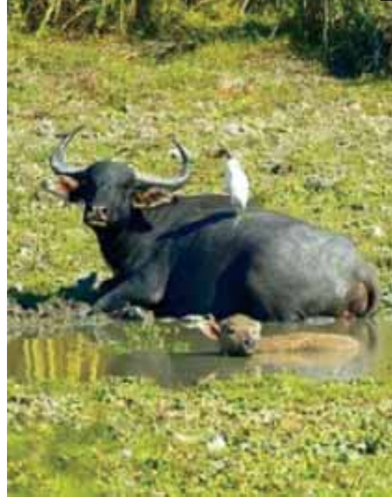
Wild Asiatic Water Buffalo - Female with calf in Kaziranga National Park

migratory birds during winters like the greylag geese, bar headed geese, gadwall, falcated duck, red crested pochard and northern shoveller.