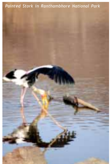
Painted Stork in Ranthambhore National Park