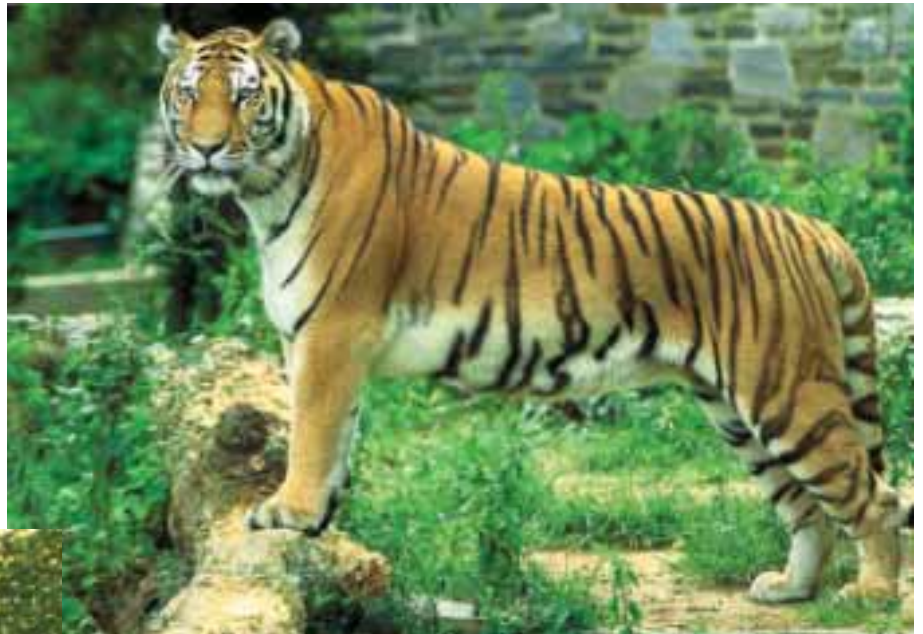
Bengal Tiger in Sunderbans National Park

April and May see the park covered with flaming red leaves of the Genwa along with crab like red flowers of the Kankara and the yellow blooms of Khalsi. The Sunderbans is home to more than 400 tigers, chital, deer, monkey, a large number of fishes and red Fiddler crabs and Hermit crabs. One can also spot crocodiles, Ridley Sea Turtle, the King Cobra, Rock Python and Water Monitor.