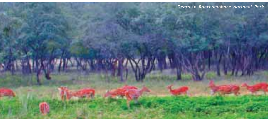
Deers in Ranthambhore National Park

Travellers can enjoy elephant safaris or take a ride through the jungle in jeeps. The best time to visit Kaziranga is from mid-November to early April.