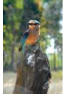
Blue Jay or the Indian Roller at Kanha National Park

Kanha National Park has a diverse fauna and flora. Bamboo forests give way to Sal forests and meadows. One can see the spotted deer, antelope, the black buck, the barking deer and the Barasingha.