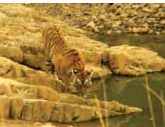
Tiger at waterhole in Ranthambhore National Park

Ranthambhore National Park is famous for its tigers and is regularly visited by wildlife photographers. The park also has 300 species of trees, 50 aquatic plants, 272 birds, 12 reptiles including the marsh crocodile and amphibians and 30 mammals. One can also spot other animals like the sambhar, chital, nilgai, gazelle, boars, mongoose, Italian hare, monitor lizards and a large number of birds.